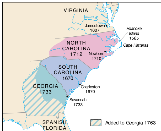
Early Carolina and Georgia Settlements

Although northern Carolina, unlike the colony's southern reaches, did not at first import large numbers of African slaves, both regions shared in the ongoing tragedy of bloody relations between Indians and Europeans. Tuscarora Indians fell upon the fledgling settlement at Newbern in 1711. The North Carolinians, aided by their heavily armed brothers from the south, retaliated by crushing the Tuscaroras in battle, selling hundreds of them into slavery and leaving the survivors to wander northward to seek the protection of the Iroquois. The Tuscaroras eventually became the Sixth Nation of the Iroquois Confederacy. In another ferocious encounter four years later, the South Carolinians defeated and dispersed the Yamasee Indians.