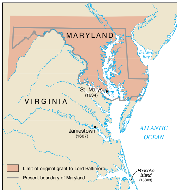
Early Maryland and Virginia

was still persecuting Roman Catholics; among numerous discriminations, a couple seeking wedlock could not be legally married by a Catholic priest.